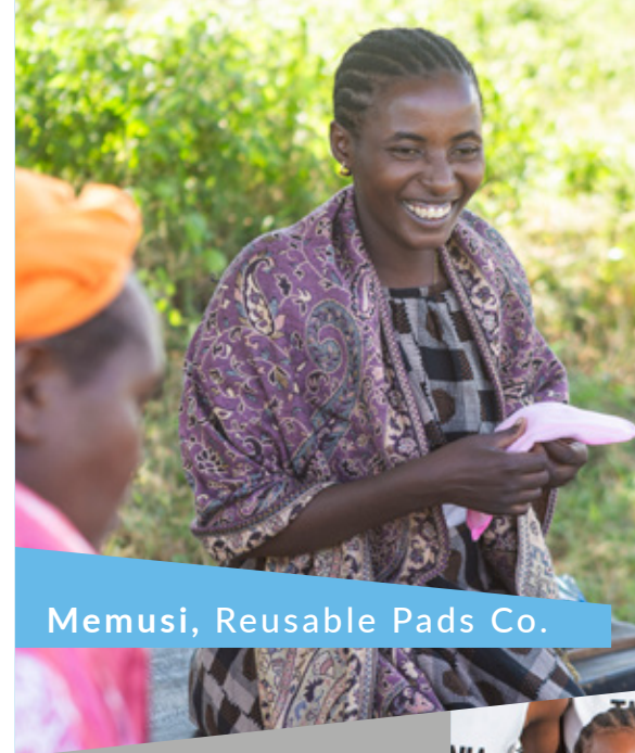
Memusi, Reusable Pads Co.

Reusable Pads Co. advocates for menstrual health while distributing reusable sanitary pads to keep girls in school during menstruation.