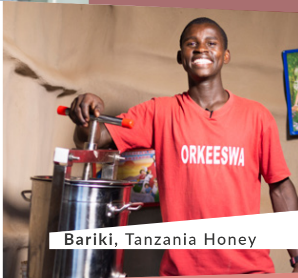
Bariki, Tanzania Honey

Tanzania Honey and Agriculture Development produces high-quality honey for local markets.