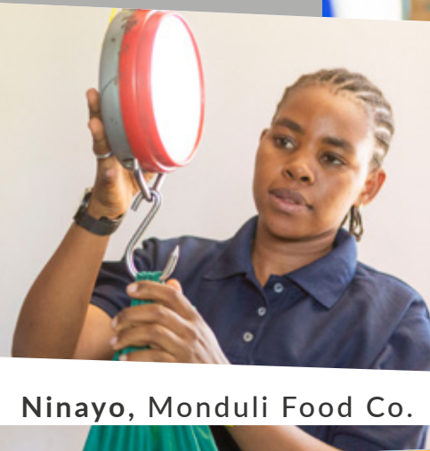
Ninayo, Monduli Food Co.

Monduli Food Co. distributes high-quality food products to schools and restaurants throughout Monduli District.